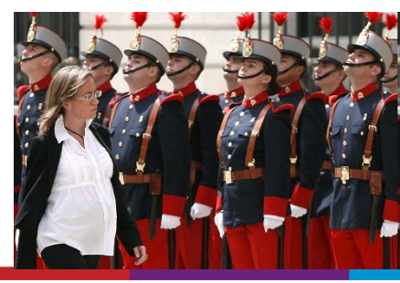
Carme Chacón span. Minister of defence Expecting first child