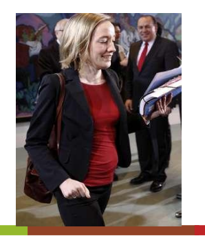
C. Schröder Minister of Family Expecting first child